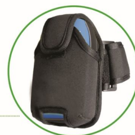
Hands free design