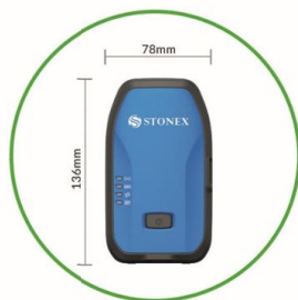
High precision positioning in a small space

Precision Farming, Mapping, GIS data collection, environmental agencies, fotogrammetry by UAV, forestry are just a short list of the fields where Stonex S580 will give a decisive impulse to the productivity and to the quality of the positioning data; with the ability to use the already existing devices, as Smartphones and Tablet with Android and Windows operating system.